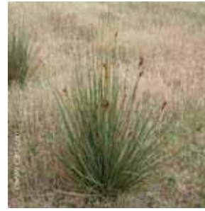
Spike or spiny rush ( Juncus acutus )