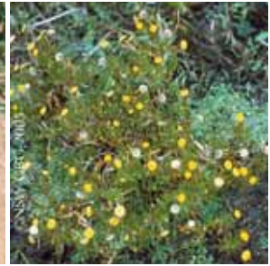
Water button ( Cotula coronopifolia )