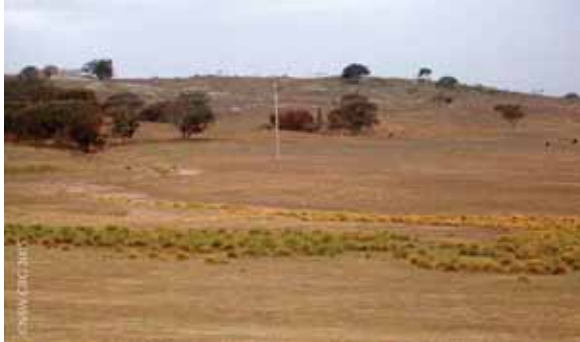
Figure 3. Dryland salinity – green areas during summer are a sign of groundwater discharge sites.