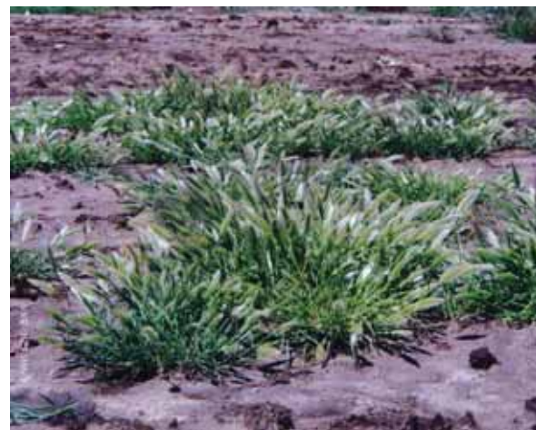
Annual beard grass ( Polypogon monspeliensis )