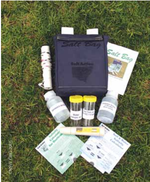
Figure 7. Contents of a Salt Bag used for salinity monitoring.