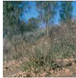
Common couch grass ( Cynodon dactylon )