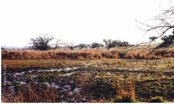
Figure 2. Waterlogged soil is often one of the first signs of a potential salinity problem.