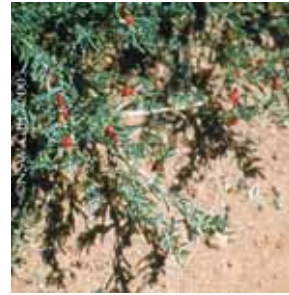
Ruby saltbush ( Enchylaena tomentosa )