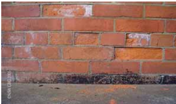
Figure 5. Urban salinity – salt damage to bricks and mortar.