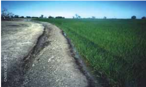
Figure 4. Irrigation salinity – salt may appear adjacent to irrigation bays.