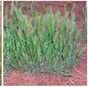
Sea barley grass ( Hordeum marinum )