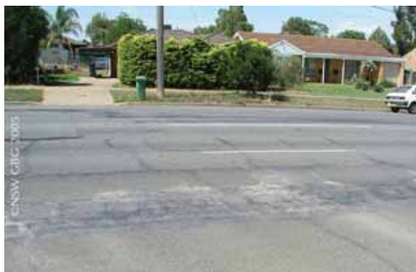
Figure 4. Destabilised road base from a shallow watertable resulting in damage to the road surface.