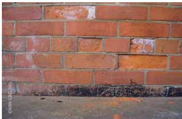
Figure 3. Salt damage to bricks and mortar.