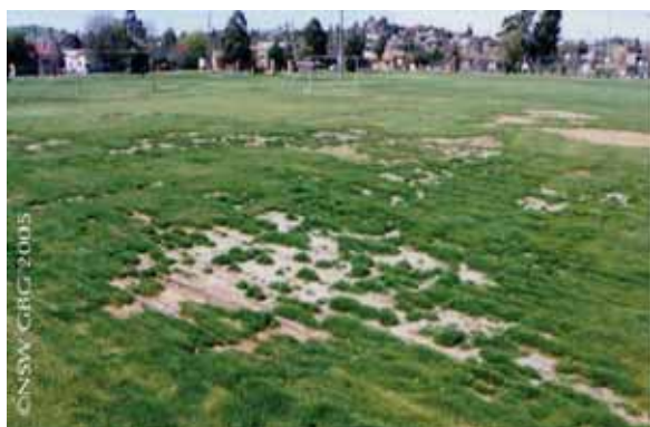
Figure 5. Saline discharge area on a cricket pitch causing vegetation decline.

Urban salinity can undermine urban buildings and infrastructure at a significant cost to local communities. There are at least 220 towns in the Murray-Darling Basin at risk from urban salinity including Wagga Wagga, Tamworth, and Dubbo (Wilson 2003). Urban salinity has also been identified as an issue in western Sydney.